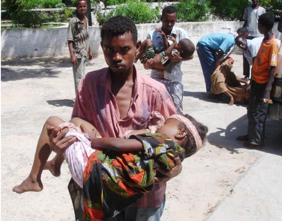
Somalis help wounded children to health facility after they were wounded by mortar shell that landed in their house in Mogadishu, Somalia, 29 July 2009

A woman from the Medina district of Mogadishu, who left Somalia in February 2010, said: