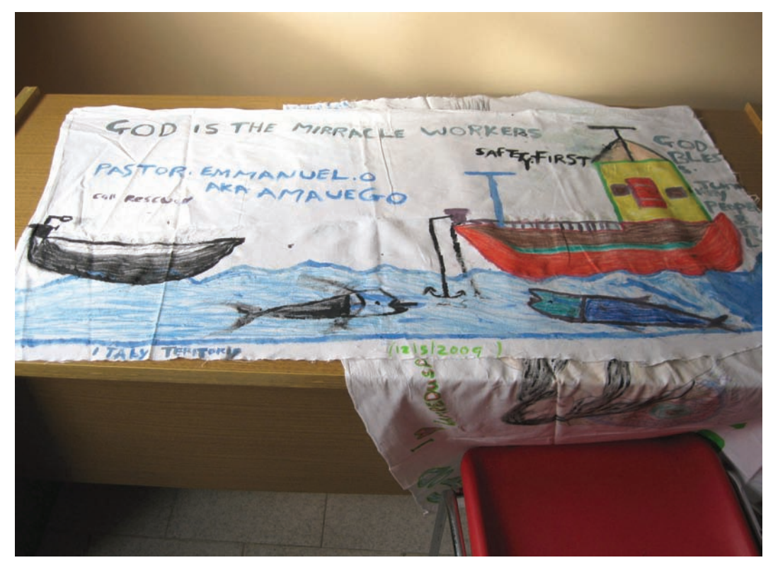
Innocent painted this picture depicting his rescue on a piece of torn sheet. To the right of the E Pinar, he has written: "God Bless the Turkey People".

Disputes over responsibility causing delayed rescues and added distress and danger are illustrated by the high profile dispute between Malta and Italy regarding responsibility for 140 migrants aboard the Turkish freighter Pinar E in April 2009. The passengers included at least one pregnant woman, children, and about 22 people who were too ill to be brought with the rest of the passengers to Sicily, but remained in Lampedusa. The captain of the Pinar E picked up the migrants in response to a distress call. Italy argued that as the migrants were intercepted in the search and rescue (SAR) zone administered by Malta they should be disembarked on Maltese territory and refused the ship permission to enter Italian waters. Malta maintained that international law required the migrants to be disembarked at the nearest safe port, which in this case was Lampedusa, Italy. After a four-day standoff and appeals by the President of the European Commission, Italy agreed to accept the migrants.